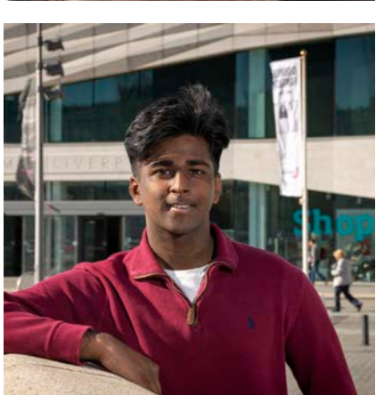
For the most current information on our programmes, including entry requirements and modules, visit: